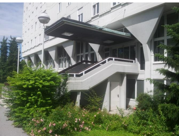
Figure 1: Faculty of Civil and Geodetic Engineering

It is recommended that you arrive from Jamova cesta as indicated in Figures 2 and 3. In this case, you will see the building of the Faculty on your right-hand side (as shown in Figure 1). The signs inside the building will show the direction to the lecture room.